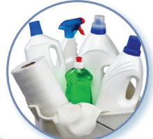
Use 50% Less Soap*