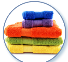
Cleaner Brighter Laundry